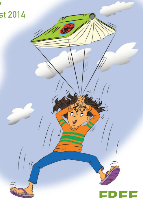
ILLUSTRATION: Trevor Pye, 2014

Whangarei Central Library & The Old Library Community Arts Centre